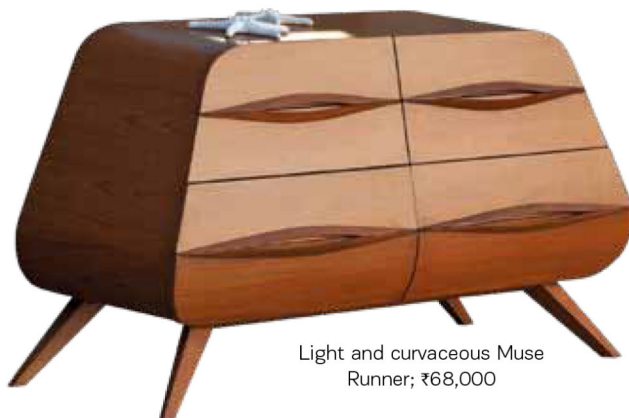
Light and curvaceous Muse Runner; ₹68,000

“ These seven pieces from our new collection are all distinctively experimental in their approach yet timeless in their design. Whether curvaceous or geometrical, each tells a different story with its form and structure. While stylishly fulfilling the purpose for which it was designed. ”