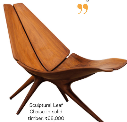
Sculptural Leaf Chaise in solid timber; ₹68,000