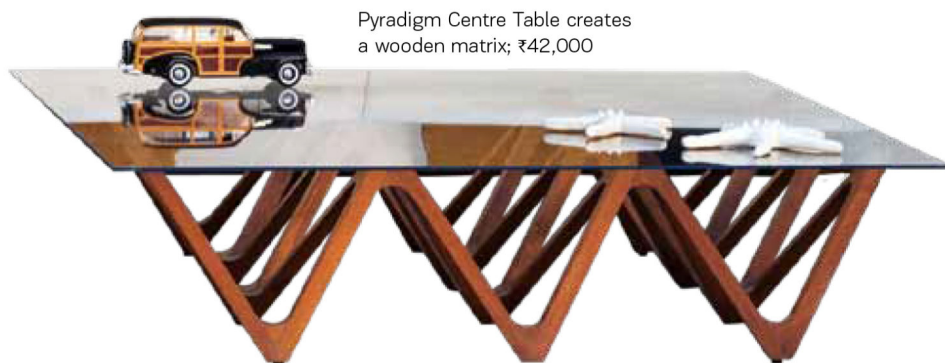
Pyradigm Centre Table creates a wooden matrix; ₹42,000