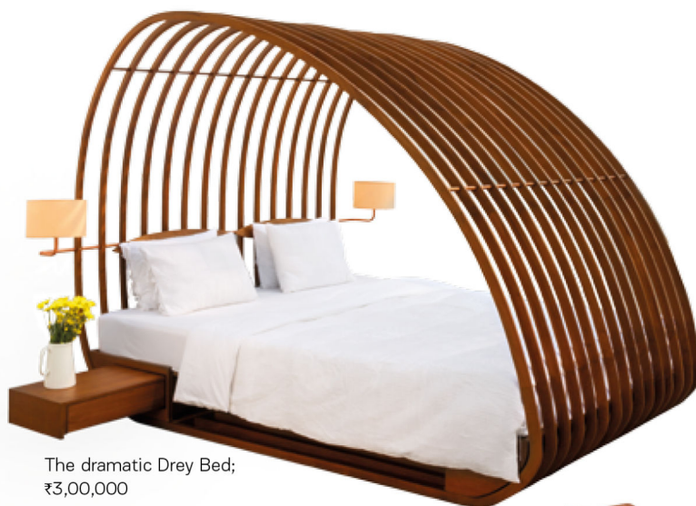
The dramatic Drey Bed; ₹3,00,000