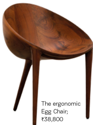
The ergonomic Egg Chair; ₹38,800