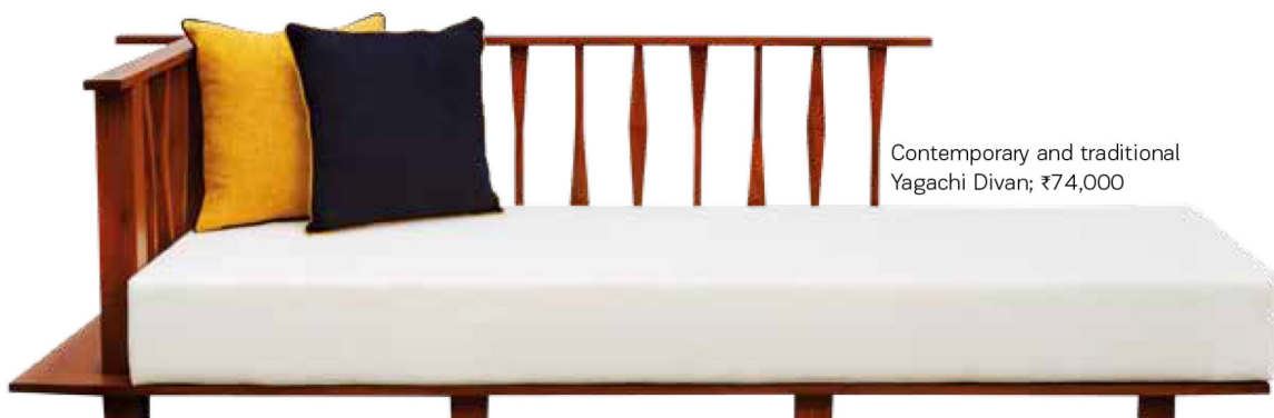
Contemporary and traditional Yagachi Divan; ₹74,000